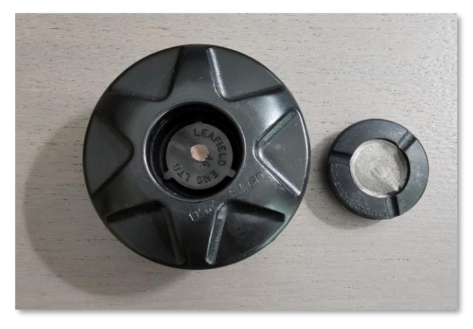
Pressure Relief Valve Seen beside filter cover