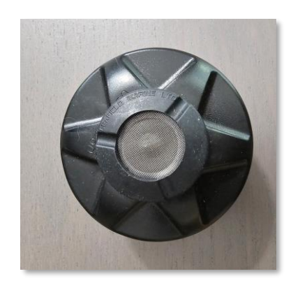
Pressure Relief Valve Seen with filter cover

Important note: as the environmental temperatures begin to lower after their afternoon peak, the unit may need to be refilled-topped off with air. This usually happens in warm climates following an extended period of outdoor use.