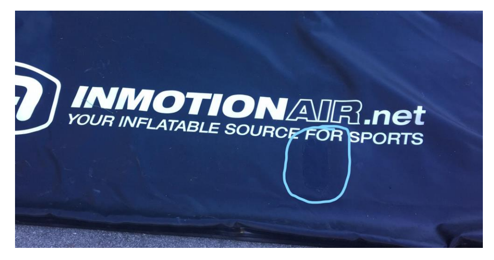
Exterior patch used in 2-layer sandwich patch shown in the circled area above in photo.

We've successfully repaired slices as long 6 inches caused by metal cleats coming down on a tube as well as larger holes the size of a 50 cent piece. These repairs require a 2-layer patch we refer to as a sandwich patch. Before attempting this patch, we recommend calling us for additional support. Basic supplies are the same as used for small hole patching.